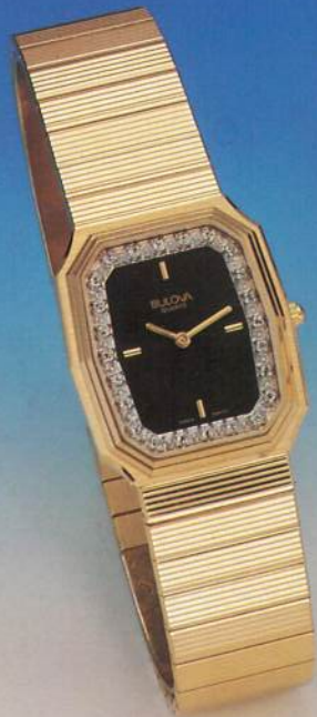
92M70 24 diamonds