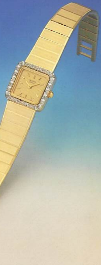
90L31 12 diamonds