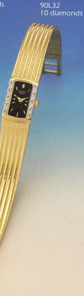
90L32 10 diamonds