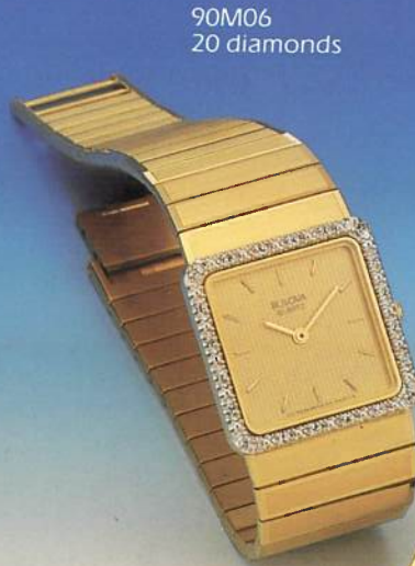
90M06 20 diamonds