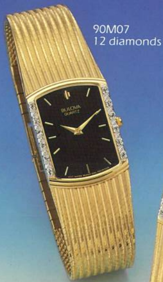
90M07 12 diamonds

Duet or solo, these are among Bulova's most beautiful watches. Superbly accurate. Gracefully styled. Dazzle-set with multiple diamonds.