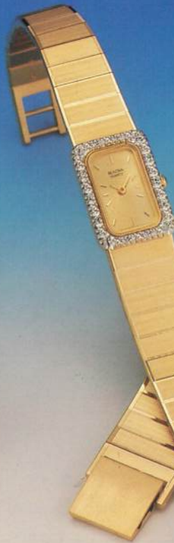
90T03 14 diamonds